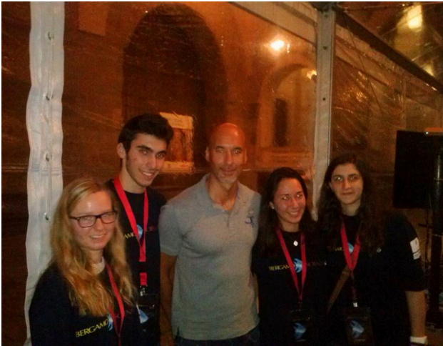
ME WITH MY FRIENDS AND VOLUNTEERS PARMITANO