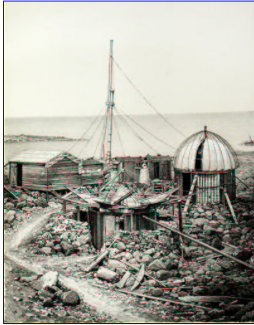
Observing camp of Commander Mouchez on the island of St Paul