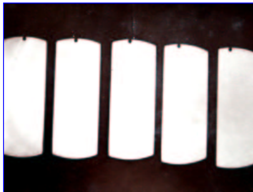
Series of photographic exposures of the Venus transit taken at St Paul

It is necessary to note three other voyages: two German, one to Mauritius and the other to the Kerguelen islands (Betsy Bay) and an American mission also to the Kerguelen islands.