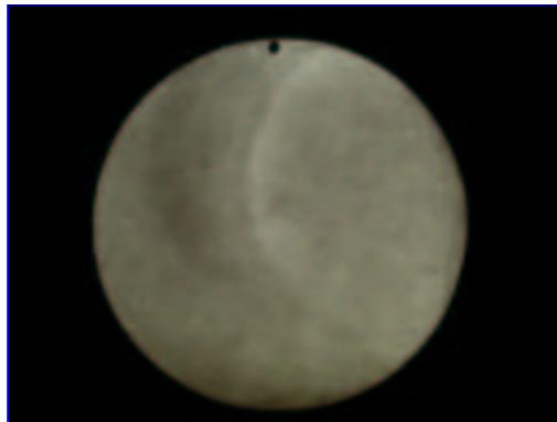
Photographic exposure taken at Saint Paul