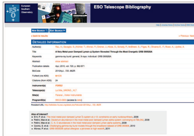
Figure 2. The new public interface of ESO’s telbib: detailed record display