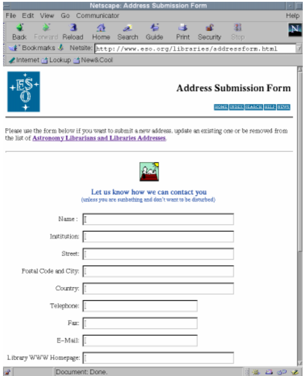
Figure 2. Address submission form