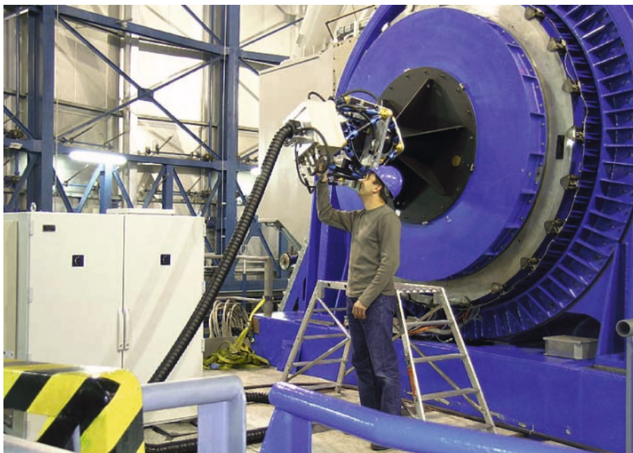
Figure 1: The ULTRACAM instrument mounted on the visitor focus of Melipal (UT3).

(UK) and the ULTRACAM project scientist. "Using ULTRACAM in conjunction with the current generation of large telescopes makes it now possible to study high-speed celestial phenomena such as eclipses, oscillations and occultations in stars which are millions of times too faint to see with the unaided eye."