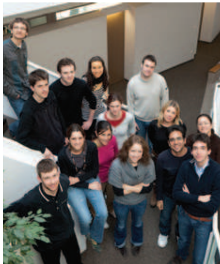
Figure 1. (Left) Group portrait of students at ESO Garching.