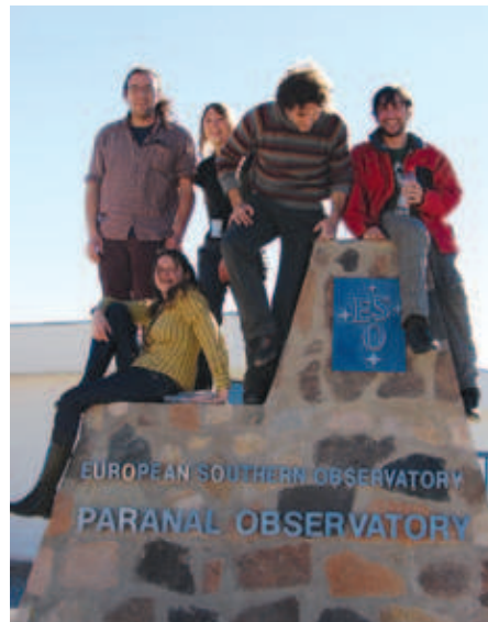
Figure 2. (Right) Students at ESO Chile enjoy an excursion to Paranal.

at universities, observatories and other organisations in Europe and beyond.