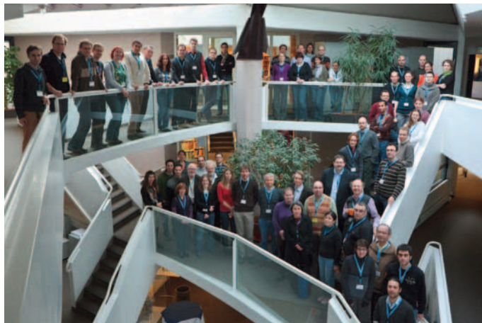
Figure 2. Participants of the workshop in the entrance hall at ESO Headquarters.

The session on stellar evolution from the main sequence onward started with overviews on the current state-of-the-art of stellar evolution as well as stellar atmospheres, and, in particular for evolved stars, on the latest hydrodynamic model atmospheres. The session included presentations of the newest results in the fields of red giant branch (RGB), asymptotic giant branch (AGB), post-AGB stars and planetary nebulae (PNe). Infrared interferometry with the VLTI and other interferometers has made enormous progress, in particular in studying the details of the molecular and dusty shells around AGB stars. By comparison to the latest hydrodynamic wind models, these studies address the unsolved problem of mass-loss and the dust driving mechanisms. For post-AGB stars, the emphasis of the presented results was placed on the origin and evolution of discs — connecting the session back to the first session on young stellar objects, on binarity, magnetic fields and the shaping mechanisms in general. Presented observations, using radio and millimetre interferometers, such as the Very Large Array (VLA), the Very Large Bolometric Array (VLBA), Merlin, or the Institut de Radio-