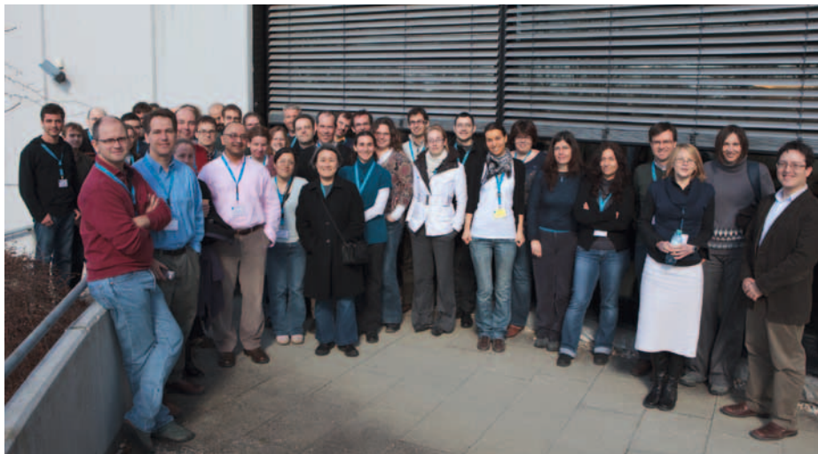
Figure 1. Participants in the interferometry primer.

Several years of observations using the VLT Interferometer (VLTI) have allowed us to gain unprecedented new insights into different stages of stellar evolution from star formation to the late stages, using the combination of high spatial and spectral resolution. Examples are discs around young stars, debris discs, stellar atmospheres and the circumstellar environment of evolved stars. Now, the upcoming dual-feed facility PRIMA on the VLTI is about to enable astrometric measurements, with one goal being the detection and characterisation of planets around stars. In the immediate future, ALMA will provide complementary observations of stars with similar angular resolution compared to the VLTI, but at sub-mm wavelengths. ALMA will observe the chemical cycle of the interstellar medium from the formation of molecules and dust in late-type stars and in molecular clouds to the