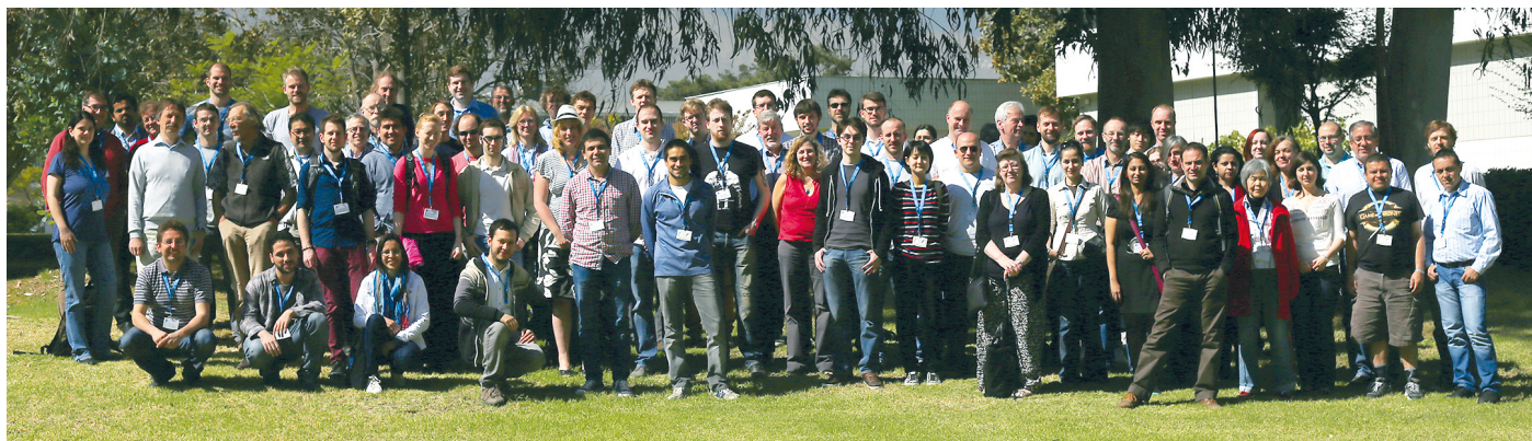
Figure 1. The conference participants in the garden at ESO Vitacura.

The workshop took place at the ESO/ALMA Vitacura campus with close to one hundred registered participants (see Figure 1). In the spotlight were the results obtained with instruments like the Cryogenic high-resolution InfraRed Echelle Spectrograph (CRIRES) and X-shooter, and the Very Large Telescope Interferometer (VLTI) spatial imaging capabilities with the MID-infrared Interferometric instrument (MIDI), the Astronomical Multi-BEam combineR (AMBER) and the Precision Integrated Optics Near-infrared Imaging Experiment (PIONIER). These, and other, instruments have for the first time opened up the milliarcsecond and sub-milliarcsecond spatial scales where the crucial accretion disc physics takes place and planet formation processes occur. In addition, space-based advances by means of the Infrared Space Observatory (ISO), the Spitzer and Herschel satellites have allowed the study of the dust and gas in protoplanetary discs at high sensitivities. The first Atacama Large Millimeter/submillimeter Array (ALMA) observations have recently revealed the ongoing planet formation process in HAeBe discs.