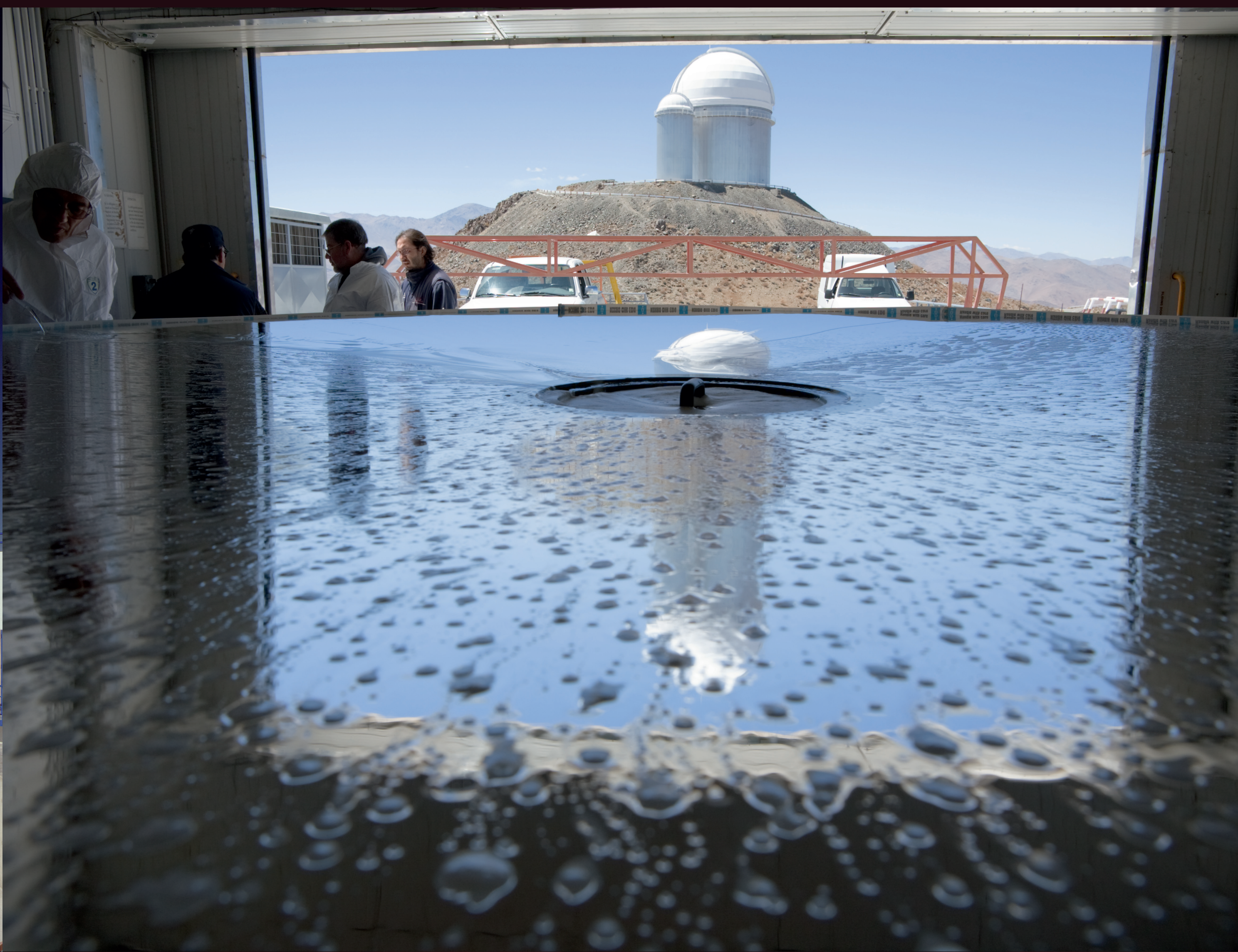
The main mirror of the NTT is removed from the telescope about twice a year for cleaning.