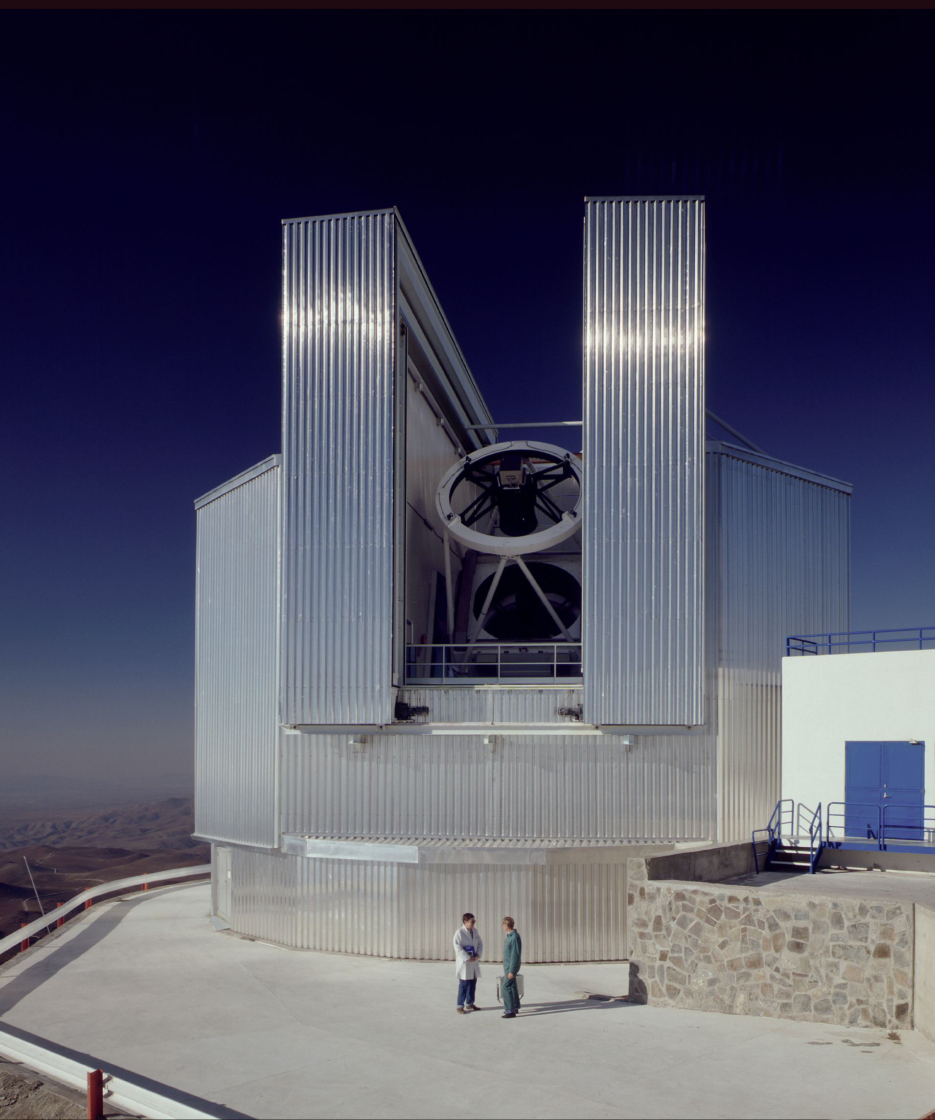
The NTT.

This technology, developed by ESO, known as active optics, is now applied to all major modern telescopes, such as the Very Large Telescope at Cerro Paranal and the future European Extremely Large Telescope. The design of the octagonal enclosure housing the NTT is another technological breakthrough. The telescope dome is relatively small, and is ventilated by a system of flaps that makes air flow smoothly across the mirror, reducing turbulence and leading to sharper images.