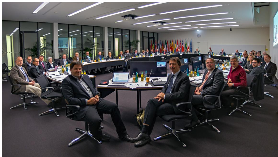
Figure 2. The members of the ESO Council and senior ESO staff photographed in the Council Room at ESO Headquarters during the meeting at which the decision to approve the two phase construction of the E-ELT was made on 3 December 2014.

only safe planning option is to consider a delay of the date of first light for Phase 1 by about two years. The postponement of the start of operations by approximately two years would allow adding much of the E-ELT operations funding, foreseen in the baseline plan for this period, to the Phase 1 construction funding, and would help to create a smoother cash-flow profile. On the other hand, it would also slightly increase the cost of Phase 1. If indeed required, the extension of the construction period would be accomplished by re-scheduling some procurement actions. The contracts themselves would not be stretched and all currently existing contracts will continue as planned. This avoids the need to re-design any sub-system and makes it possible to revert to the original timeline, or close to it, as soon as Brazil completes its ratification process or another new Member State joins.