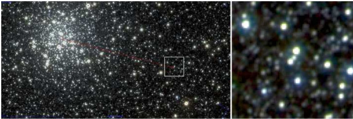
FIG. 1.— Left: 6.8 \times 3.5 arcmin finding chart showing the position of the microlensing event with respect to NGC 6553. The projected distance to the cluster center is 3.5 arcmin, well within the cluster tidal radius of R = 8.16 arcmin. Right: zoomed 30 \times 30 arcsec 2 region centered on the source star, showing that it is located just in between two brighter stars (with K_s < 12 ) that are separated by 3 arcsec. The seeing of the images is 0.8''