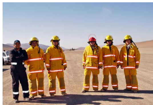
The Paranal Fire Brigade.