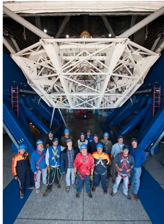
Group shot of engineers and maintenance staff at the VLT.

LSM appointed as an Emergency Coordinator at the observatories in the absence of the safety engineer during weekends or leave, are compensated under the same conditions as standby duty.