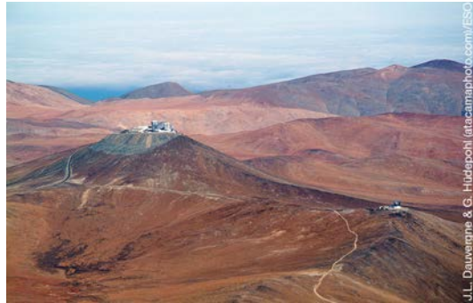
Aerial View of Paranal Observatory.