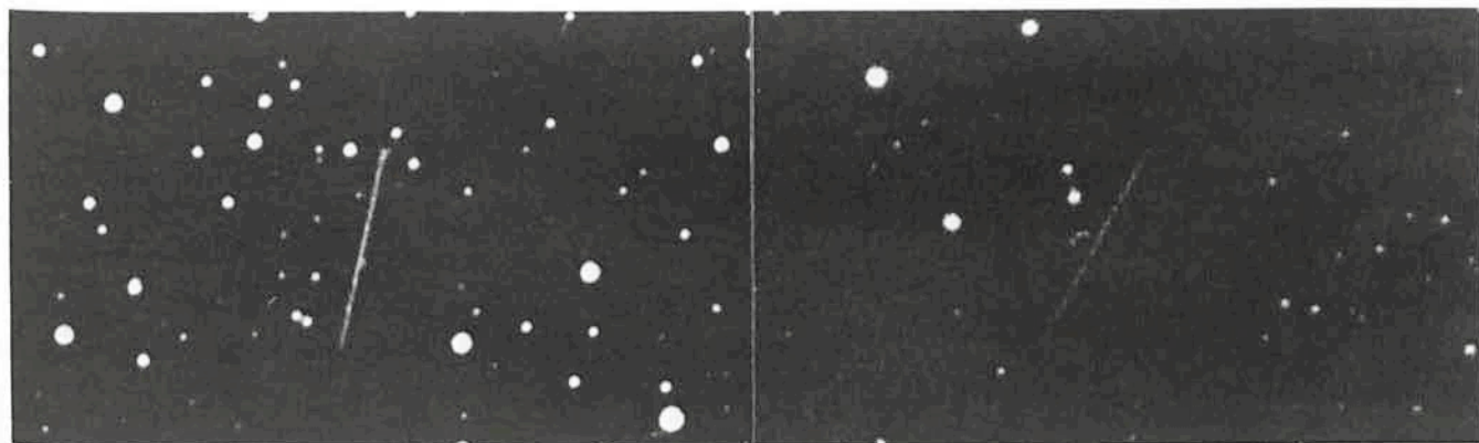
Two new minor planets were discovered with the ESO Schmidt telescope in April-May 1977. The photos show the discovery trails. To the left is that of MP 1977 HD which was seen on a 90-min red plate, obtained on April 27. It is remarkable because of its southern declination: it reached -67^\circ in June. MP 1977 JA (to the right) was discovered on May 15. Both have very unusual orbits; 1977 HD belongs to the very rare Pallas type (high inclination, semi-major axis 2.7 Astronomical Units) and 1977 JA is of Phocaea type (high inclination, semi-major axis 2.3 A.U.). Discoverer of both was ESO astronomer H.-E. Schuster.