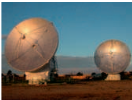
Figure 1. The two ALMA prototype antennas during an interferometric observation. The European and North American antennas are on the left and right, respectively.

Until September 2007, the emphasis at the ATF was primarily on Prototype System Integration – the process of integrating and testing the ALMA electronics. Since then, the Facility has been managed by the Computing Group. The emphasis is much more on software development, with considerable input from astronomers, although testing of production electronics in advance of deployment to Chile continues to be important. The major milestone of dynamic interferometry was achieved in November 2007. This meant that the antennas could be pointed at an astronomical source, with the receivers tuned and the correlator under computer control, so that stable interferometric fringes were obtained. We showed an example of an interferometric spectrum of the Orion Hot Core region obtained in January 2008 in a recent Messenger article (Hunter & Laing, 2008). ALMA does not differentiate between continuum and spectroscopic configurations: all ALMA observations will have multiple spectral channels, and the corre-