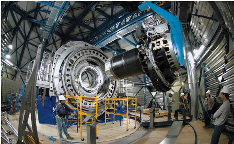
Figure 2. A view of VISTA's camera on the telescope with all the electronics boxes mounted (with their back covers off in this image). The open lifting hatch can be seen on the right, with the yellow crane above. The white circle at the top serves both as a Moon screen, and as a screen for taking linearity sequences and instrument health monitoring frames.

Details of the design of VISTA were given in Emerson et al. (2004), a progress update in Emerson et al. (2006), pictures of the NIR camera in The Messenger (131, 6), the site in issue 132 (p. 55), the primary mirror (M1) installation in issues 132 and 133 (p. 6 and 67 respectively), the camera being lifted up through the azimuth floor (138, 2) and the first release of images was also described in The Messenger (138, 2). Here we outline some interesting points from the commissioning period.