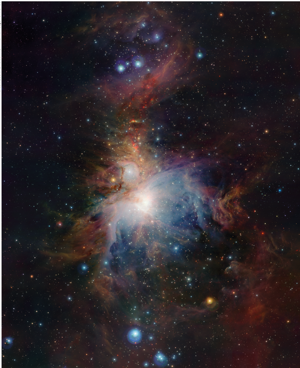
Figure 5. Orion Nebula (M 42 and M 43) composite image in ZJKs filters is shown. See ESO Press Release eso1006 for more details.

expected, with minor improvements being worked on to further enhance its reliability. The VISTA ZJKs 1 \times 1.5 degree image of the Orion Nebula in Figure 5, of which the front cover image is a only a small part, indicates how impressive its wide-field views are.