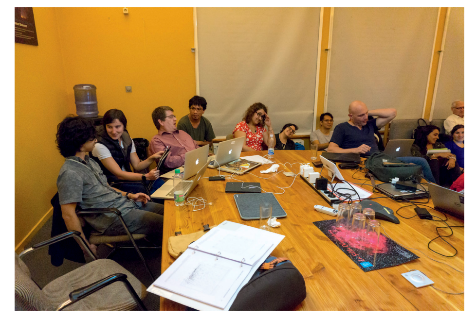
Figure 3. An interesting part of the school is the scheduling of the different programmes that compete for observing slots. Here the groups are trying to coordinate their observations in the La Silla School "War Room".

survey<sup>2</sup>, were used to confirm their nature photometrically (i.e., whether or not they are accretors).