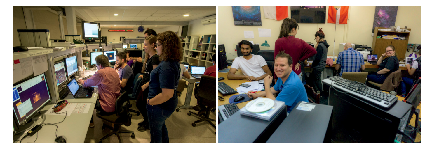
Figure 2. Students getting real-life experience at the consoles of the NTT (left), and the Danish telescope (right).

nature of the accretors in the observed objects spectroscopically. Similarly, DFOSC was used to perform broad-band V, R, I and narrow-band H \alpha imaging of young stars in Chamaeleon. The images, targeting a number of T Tauri stars with H \alpha emission studied by the Gaia–ESO