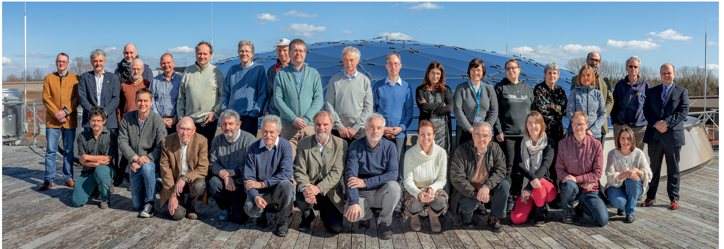
Figure 2. The conference workshop photograph.

a one-day event. The goal of the conference was to gather, consolidate and understand the wishes and needs of the astronomical community for upgrades that would ensure the high science productivity of FORS into the future.