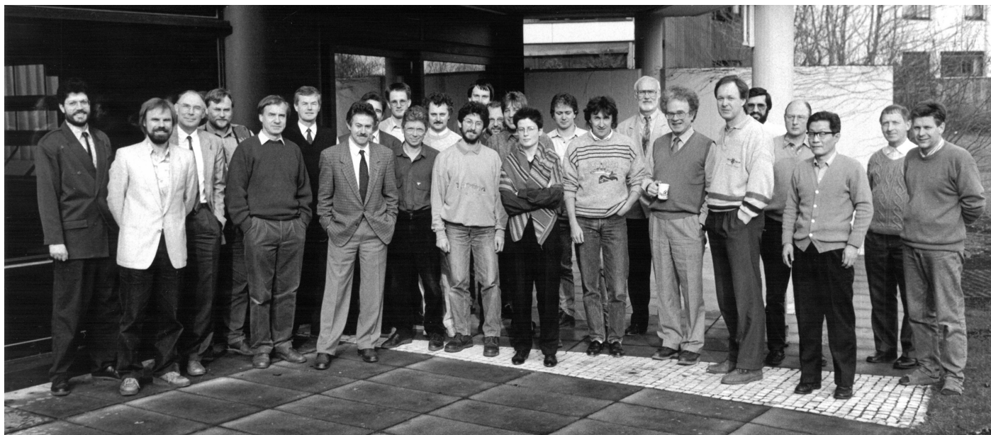
Figure 3. The FORS team during the preliminary design review in 1992.

An outstanding issue in modern astrophysics is what reionised the Universe and when and how the first objects formed. Laura Pentericci showed what was the main initial goal of FORS when conceived, i.e., deep spectroscopy to identify a large population of Lyman- \alpha emitting galaxies up to z > 7 (Vanzella et al., 2008). She presented the deepest FORS2 spectrum ever obtained in the reionisation epoch — a 52-hour-long exposure that showed... nothing! This in fact indicates that reionisation might be a more extended process than previously thought and not yet completed at z = 6 .