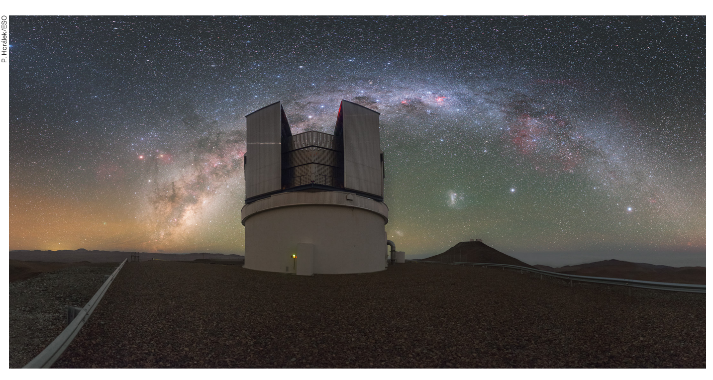
This magnificent image shows ESO's Visible and Infrared Survey Telescope for Astronomy (VISTA), located at Paranal Observatory. The Milky Way galaxy sweeps behind the telescope with several nebulae visible, like the Gum Nebula and the Carina Nebula.