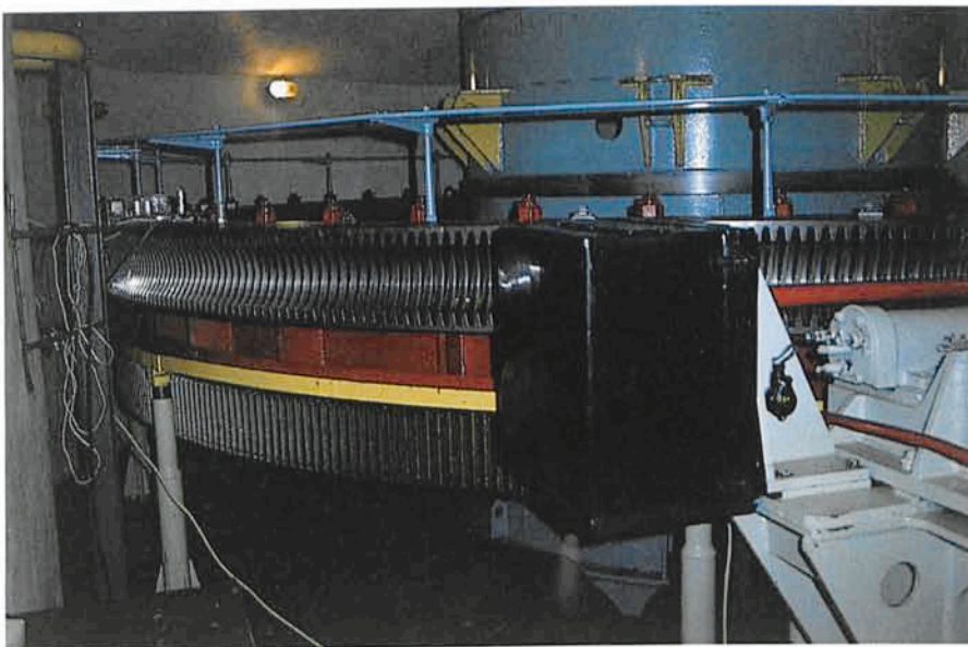
The azimuth drive wheel.

The ESO delegation was interested to learn about the Soviet plans in connection with future large telescopes and the desire to continue the exchange of experience in such matters. There is little doubt that with the development of new astronomical sites in the USSR, in par-