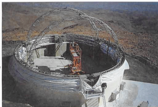
Figure 2: The open dome. The motor for lowering the auxiliary hoops has still to be installed.

fully demonstrated so far, and now the work will concentrate on other aspects such as the thermal behaviour, safety devices, resistance to extreme conditions.