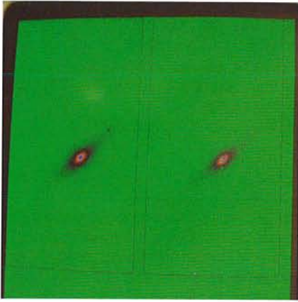
Figure 3: NGC 3115-S0 galaxy; B_T = 9.75 . Left panel: original CCD frame ( 1.7 \times 0.9 ). Right panel: Hunt deconvolution.