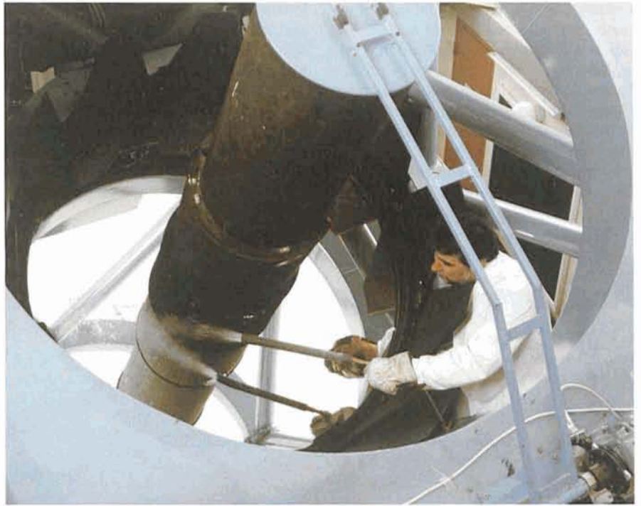
Figure 1: CO 2 cleaning.

It is an easy matter to obtain rapidly a growing awareness of the importance of keeping telescope and instrumentation areas as clean as possible. Opticians will have the important task to survey