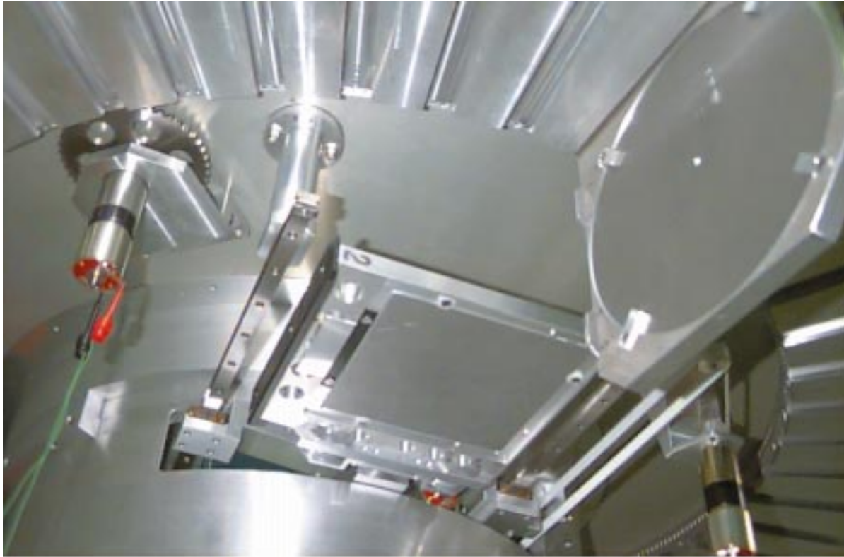
Figure 2: A view of the WFI filter exchange mechanism from the bottom and as assembled for first tests in spring 1998. The rectangle near the centre is a mount for interference filters (a dummy is visible) rotated into a plane perpendicular to the optical axis but outside the telescope beam; the recess for the filter intersecting the light towards the tracker CCD is on the left. The grooves at the top of the picture are located on the filter storage ring; there are fifty of them in total, and each can accommodate one filter. The rectangle in the upper right corner is a holder for the larger circular glass filters (with a dummy inserted) in its storage position. The filter ring can be rotated by means of the cogwheel in the upper left corner and the attached motor.